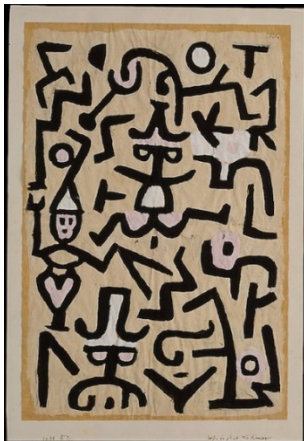
Paul Klee Comedians’ Handbill (1938)